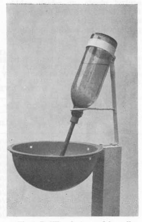
Fig. 2. Refilling device used for yellow pan aphid traps.