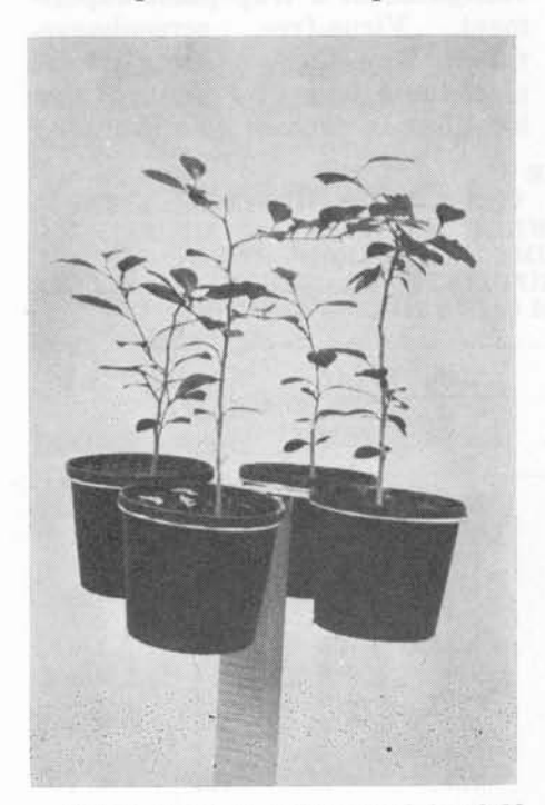
Fig. 1. Support system used for field exposure of Key lime trap plants.

Aphid flight activity was assessed with a modified version of the Moericke yellow water trap (3). A refilling device prevented the traps from drying (fig. 2). One