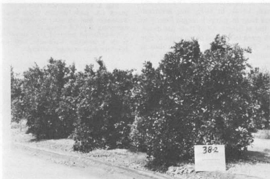
Fig. 2. Three 10-year-old trees of experiment 2 grown from Valencia buds carrying R 4 SY4 virus when propagated on healthy sour orange seedlings. The two control trees adjacent to this group died early from natural infection.

The early, severe reaction of six of the eight control trees in this group and the performance of the immunized trees make it obvious that the presence of the RSY4 virus in these trees has provided good protection against naturally occurring strains of tristeza virus although the RSY4 virus itself has reduced the growth rate of most of the trees. Three preimmunized Valencia on sour orange trees of this experiment are shown in fig. 2.