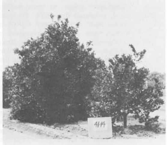
Fig. 1. Ten-year-old trees in experiment 1A. Left, grown from healthy Valencia bud on sour orange cutting carrying R_1 SY2 virus. Right, a naturally-infected control tree developed from a healthy Valencia bud on a healthy sour orange cutting.

feet high, definitely stunted from tristeza infection, but now in somewhat of an equilibrium stage of the disease. One of these and a preimmunized tree of group 1 are shown in fig. 1.