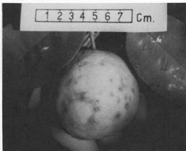
FIGURE 1. Sunken discolored areas in the rind of an inoculated Duncan grapefruit. Some areas show a circular arrangement.

FRUIT.—The fruit symptoms consist primarily of localized, gum impregnated spots in the albedo. When superficial gum deposition is accompanied by necrosis of the cuticle and the oil glands, these small necrotic spots (5 to 8 mm) frequently coalesce to form larger lesions which then resemble those caused by anthracnose ( Colletotrichum sp.). As a matter