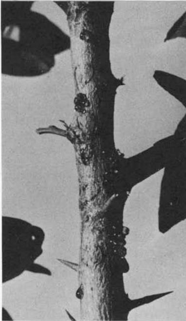
FIGURE 2. Gum exudation on a Marsh grapefruit seedling, three to five months after inoculation.