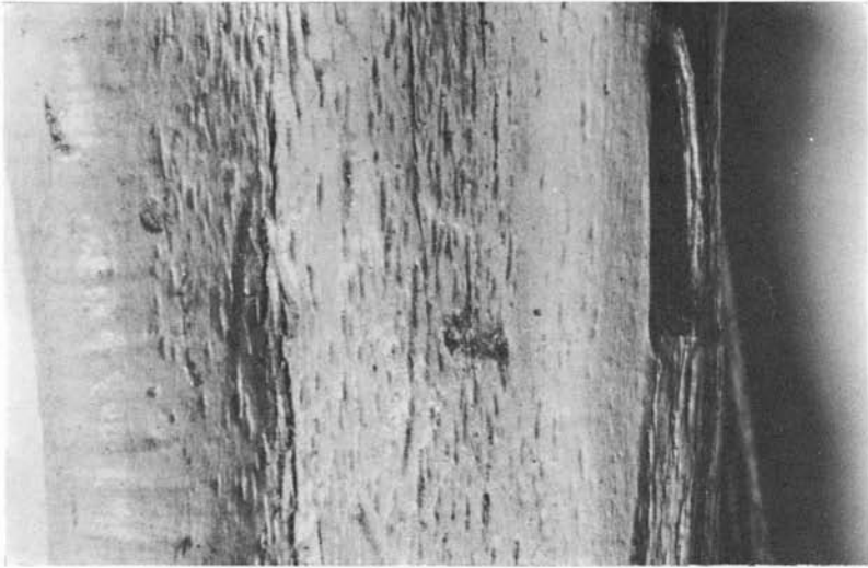
FIGURE 1. Stem pitting on the Rough lemon rootstock of a Pera sweet orange tree.

1954. Half of these varieties were imported selections, and the remainder were old-line selections previously grown at the Station. Each of the varieties was worked on 2 plants of each of the following rootstocks: Cleopatra, Rough lemon, Rangpur lime, and common sweet orange. Each year from 1961 to 1965, a strip of bark was removed from each of the orange trees at the bud-union. The bark and the exposed wood were examined for stem pitting.