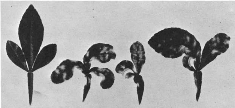
FIGURE 1. Healthy leaf of citremon and leaves from a plant infected with citrange stunt virus.

[ C. sinensis (L.) Osb. x P. trifoliata ] cause the same symptoms described by the authors (6) on citremon (Fig. 1) and Troyer infected directly from Meyer lemon. These are: occasional, slightly depressed, blotchy areas on green twigs which develop into superficial lesions that cause the twigs to bend or curve; cessation of growth on the lesion side, causing the twig to bend sharply from its normal direction and resulting in a zigzag pattern of growth; deep pits that develop in the wood as the twig becomes older and often occur as a series of vertically aligned pits; and with continued growth, the merging of these pits into longitudinal