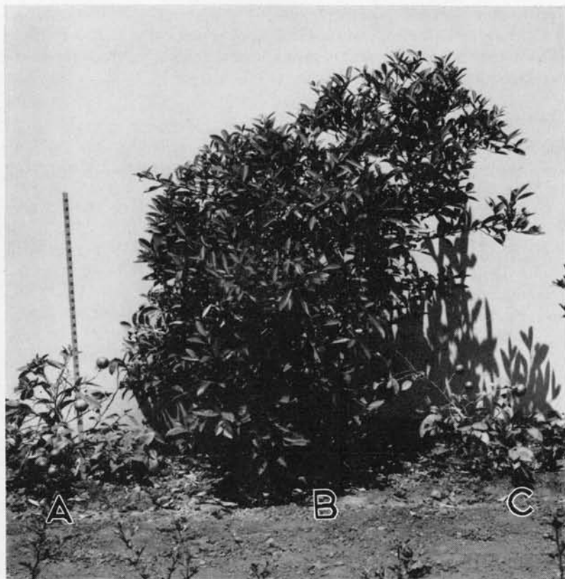
FIGURE 2. A. Rangpur C 26-1 on sweet orange. B. Rangpur D 4-24 on sweet orange. C. Rangpur D 4-24 on sweet orange with Rangpur C 26-1 inoculum. All 2 years old.