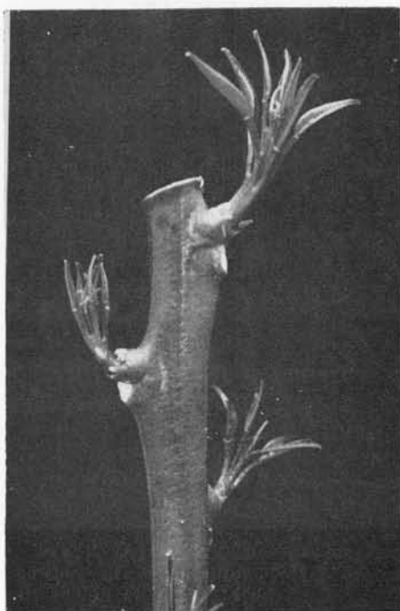
Fig. 3. Detail of flushes produced by budwood of Washington Navel orange cultured in vitro for 14 days.

Several experiments were done to study the optimal conditions for the production of flushes from the budsticks. Thickness of budwood between 4 and 6 mm in diameter did not influence sprouting of buds. Triangular budwood from vigorous twigs also gave similar results. No differences were found among budwood collected in different seasons of the year or collected in winter and stored at 8-10 C up to 4 months. After this storage period, budwood of several culti-