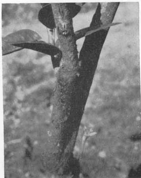
Fig. 2. Bergamot branches showing symptoms of gummosis.

Gummosis was widespread on all three cultivars. Trees 7-8 years-old, begin to show progressive decline, stunting, reduced yield, and yellowing of the leaves. At this stage the bergamot portion of the trunk near the bud union shows some bumpy areas which crack and ooze gum. At a more advanced