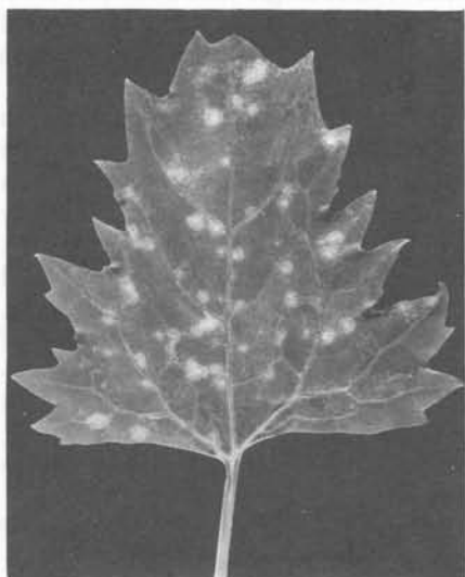
Fig. 3. Local lesions on leaf on Chenopodium quinoa mechanically inoculated with isolate CRSV-4 Photographed 6 days after inoculation.

transmitted the CRSV-4 isolate mechanically directly from citrus to citrus with little difficulty (Garnsey et al. , 1976), we had little success transmitting CRSV-4, CRSV-5, and several Texas isolates back to citrus in sporadic initial tests. The difficulty was apparently due to our initial choice of receptor plants (usually Duncan grapefruit or sour orange), although warm summer conditions and less-than-optimum titer in the G. globosa plants used as inocula sources may have contributed to the problem.