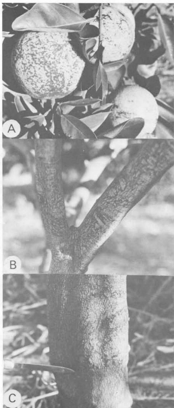
Fig. 1. Bark suberification of Natal sweet orange. A, roughness on the peel of fruits. B, roughness of the bark of branches. C, roughness of the trunk above the bud union.