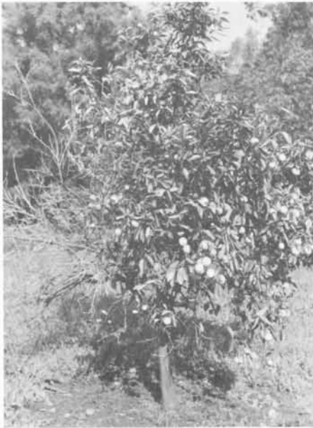
Fig. 2. Six-year-old Valencia orange tree partially affected by marchitamiento repentino disease.

All trees with "marchitamiento repentino" were budded on a local selection of trifoliate orange. Experimental work underway will certainly show if the disease is related to this rootstock or will affect trees on other rootstocks.