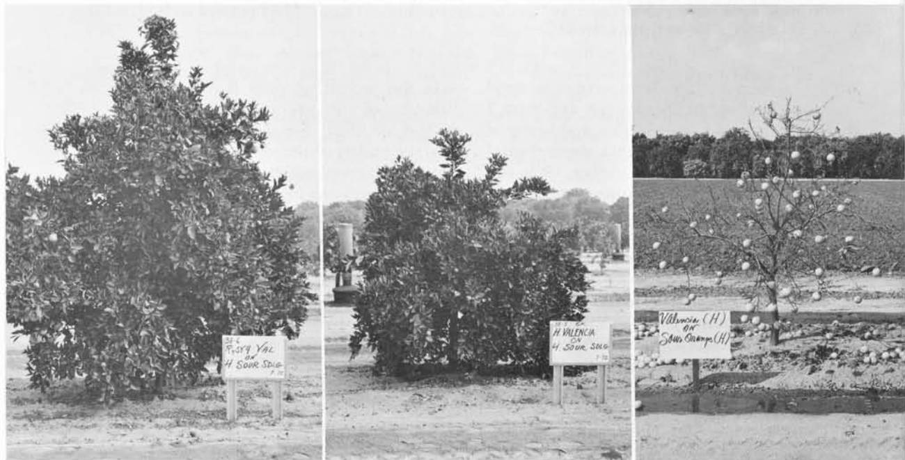
Fig. 2. Left, tree grown from R 5 SY4-infected Valencia bud on healthy sour orange seedling after six years in field. Center, healthy check tree that developed mild tristeza in 1969 and continued to make some growth. Right, naturally infected check tree that developed symptoms in 1969 and collapsed in spring of 1970. Right, photograph taken July, 1970; other trees photographed July, 1972.

of sour orange and Eureka lemon carrying a single isolate of RSY4 virus, mistakenly identified in the original report as R 2 SY4. A review of the records showed that two SY4-recovered isolates were used in preparing the trees of experiment 2 that eventually were placed in field plantings. The trees now under study in this experiment were developed on sour orange and Eureka lemon, with buds from two 2-year-old Valencia trees propagated earlier, in the greenhouse, on rooted cuttings from two different SY4-recovered lemon seedlings, 101-28 and 89-439. Because another isolate identified originally as R 2 SY4 is now under study in other field trees, it is necessary to identify the two isolates used in experiment 2 as R 4 SY4 and R 5 SY4. Four trees on sour orange and four on Eureka lemon carry R 4 SY4, and four trees on sour orange have R 5 SY4 as the protecting virus. Controls consist