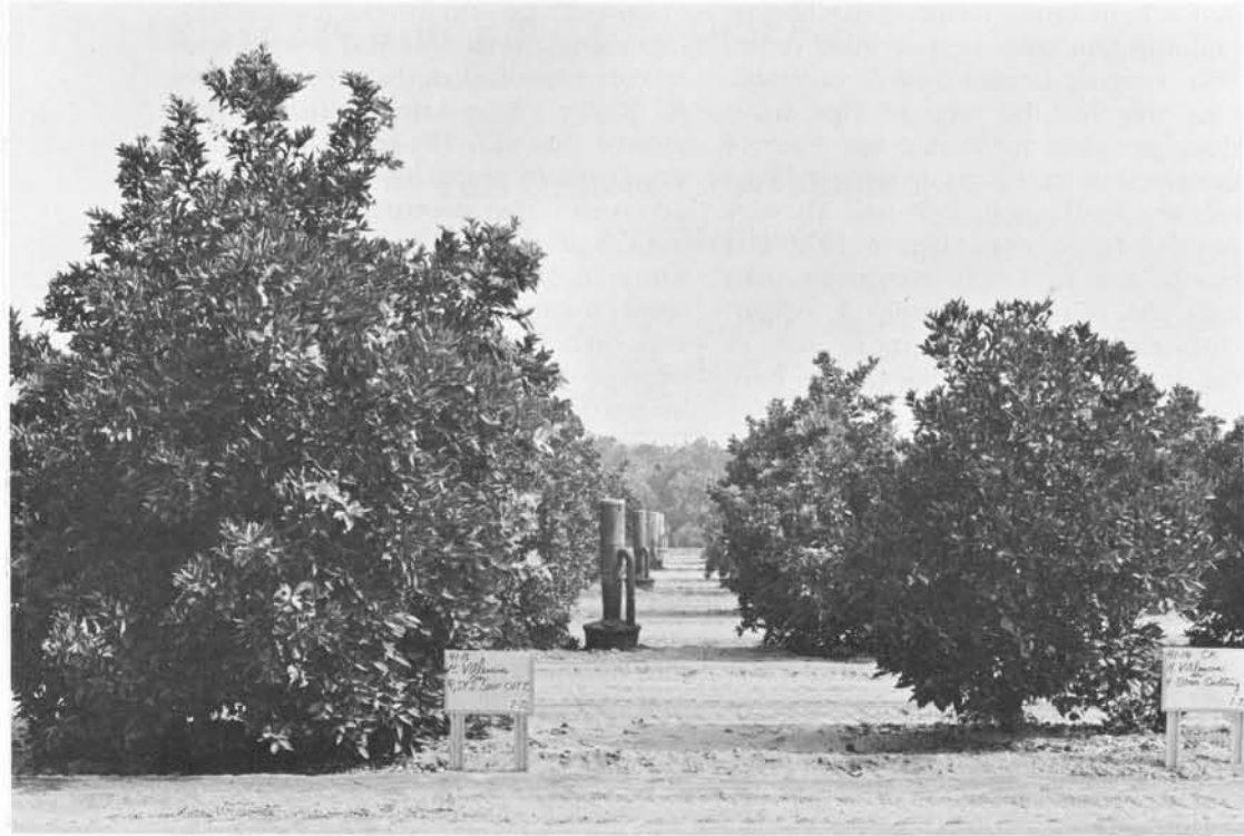
Fig. 1. Left, tree developed from healthy Valencia bud propagated on a rooted cutting from sour orange that recovered from SY2. The protecting virus is R 1 SY2. Right, check tree of healthy Valencia on healthy sour orange cutting. This tree developed symptoms of tristeza in 1969 from natural infection. It showed typical symptoms throughout 1970, but made some recovery thereafter and reached an equilibrium stage. Trees planted in field July, 1966; photographed July, 1972.

Group 2. Three trees were rated good to excellent in appearance, and were 7 to 9 feet in height, with a good crop of ripe fruit. One tree that showed mild tristeza symptoms in October, 1969, collapsed in 1970 and subsequently died. The severe reaction of this protected tree suggested that, by mistake, the sour orange cutting rootstock had been virus-free when it was budded. Possibly it had been intended for use as one of the healthy control trees. Seedling limes inoculated from it gave the tristeza reaction, but lemon seedlings inoculated with this source of virus reacted severely when challenge-inoculated with SY2 virus. This established that the tree that collapsed from tristeza did not