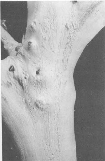
FIGURE 2. The trunk of a Baianinha sweet orange tree on Rangpur lime with bark removed to show a linear disposal of inverse pits extending to the branches.

Transmission of decline was attempted by 1. budding or side grafting greenhouse-grown healthy plants with budwood or small branches from severely diseased trees or by a combination of budding and side grafting; 2. topworking branches of healthy trees in the field with budwood from diseased trees; 3. inserting large pieces of