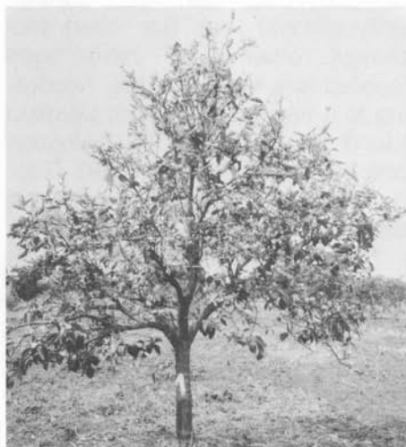
FIGURE 1. A 5-year-old tree of a nucellar clone of Baianinha sweet orange showing severe symptoms of decline.

In some respects also, symptoms of decline are similar to those of greening or stubborn. The fact that a vigorous branch may show leaf symptoms before the rest of the tree does, the facts that symptoms are conspicuous during periods of low temperature and disappear when the temperature becomes high, and the difficulty of transmitting the disease by budding are reminiscent of greening as it occurs in Africa and Asia. On the other hand, the rotten roots, inverse pitting, and stem-pitting symptoms associated with decline are not characteristic