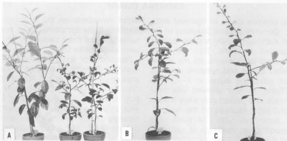
FIGURE 1. Symptoms of satsuma dwarf and related viruses on satsuma budlings: A. Non-inoculated (left), and infected with SDV 1 (right). B. Symptoms of NDV, similar to satsuma dwarf. C. Symptoms of CMV.