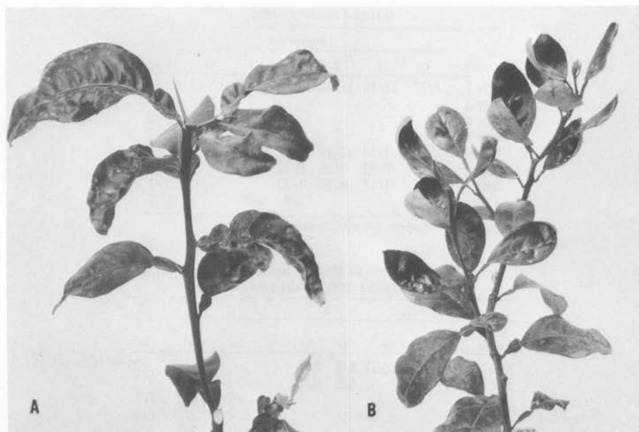
FIGURE 2. Symptoms in mature leaves of citrus seedlings infected with SDV 2. A. Crinkling of leaves of a tengu mikan seedling. B. Upward cupping and crinkling of leaves of an infected kunembo seedling.