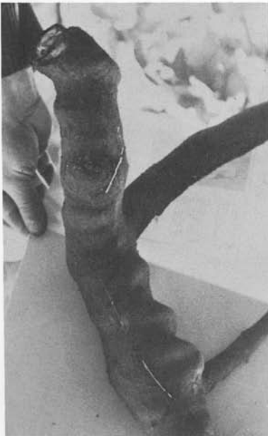
FIGURE 1. Finger mark symptoms on a branch of a mascolino pregiato lemon tree, with bark not removed.

In Italy, this symptom has been observed since 1964 on 28-year-old trees of mascolino pregiato lemon (Fig. 1), a local clone of the feminello variety grown on sour orange ( C. aurantium L.) rootstock at Siracusa (Sicily). Later, the symptom was observed on a 35-year-old lemon tree on Procida Island, on two 25- to 30-year-old bergamot ( C. bergamia Risso) trees at Reggio Calabria, and on a 15-year-old Avana mandarin ( C. reticulata Blanco) tree in the Sorrento area. The last also showed