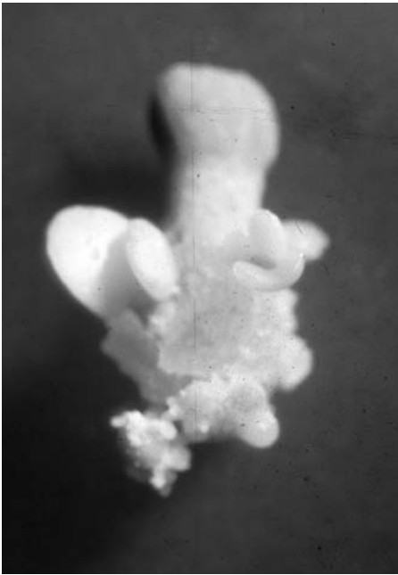
Fig. 1. Citrus embryos from style and stigma cultures.

Following the protocol of D'Onghia et al. (4), flowers were collected before opening and were surface-sterilized by immersion for 5 min in ethanol (70% v/v in water), 15 min in 2% sodium hypochlorite (w/v in water). Stigmas and styles were excised aseptically from flowers, and placed vertically onto Murashige and Skoog (6) semi-solid (7 g/l agar) medium (MS) containing sucrose (146 \mu M), malt extract (0.5 g/l) and BAP (13 \mu M). The pH of the medium was adjusted to 5.7 \pm 0.1 with 0.5 M KOH before autoclaving at 121°C for 15 min. Explants and calluses were subcultured onto fresh medium at 30-day intervals and maintained in a climate chamber at 25 \pm 1^\circ\text{C} under a 16 h day length, and a photosynthetic photon flux of 100 \mu\text{mol m}^{-2}\text{s}^{-1} Osram cool-white 18 W fluorescent lamps. Somatic embryos (2-3 mm in diameter) were isolated from embryogenic cultures (Fig. 1) and germination was attempted in hormone-free MS medium.