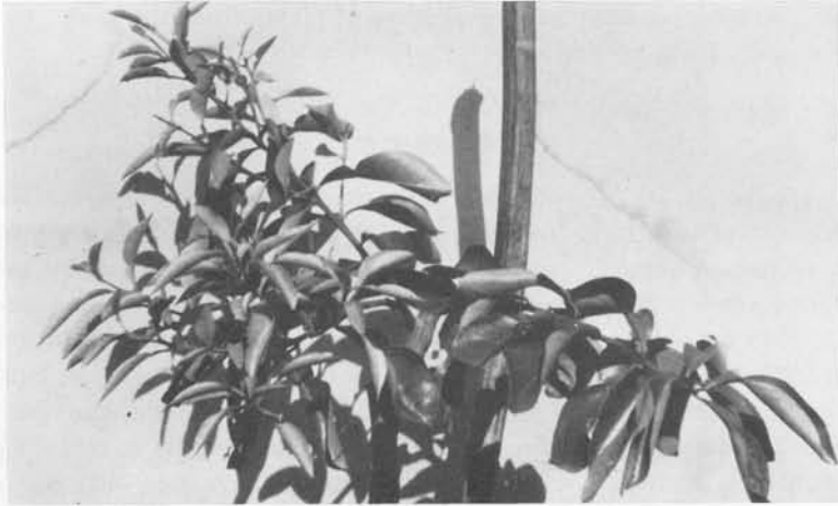
FIGURE 2. New shoots produced by a one-year-old Marsh grapefruit tree after inoculation with buds from mandarin No. 1945 and exhibiting boat-shaped leaves.

nor Key lime seemed to be affected by the suspected agent, although Key lime plants were stunted, which could have been induced by tristeza virus.