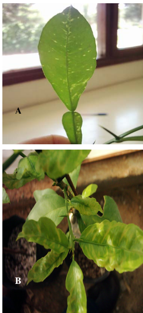
Fig.2. Sour orange leaf with YVC symptoms (A), and Kutdiken lemon inoculated with YVC.

Graft transmissible studies showed that YVC was transmissible to sour orange, and Interdonato, Kutdiken, Italian and Lamas lemon varieties (Fig. 2). However, Madam Vinous, Pineapple, Navelina, Washington navel, Valencia oranges, satsuma, Clementine, Fremont, Nova, Parson's Special, Kara mandarin varieties, Star Ruby, Rio Red, Marsh Seedless, Duncan grapefruits, Tahiti lime and rough lemon did not show any YVC symptoms. The YVC was compared with Citrus psorosis virus (CPSV), Citrus variegation virus (CVV) and Citrus Chlorotic Dwarf Disease (CCD). CPSV induced symptoms on sour orange, lemon, mandarin, orange and grapefruit varieties, but YVC symptoms only appear on sour orange and lemon varieties. The DAS-ELISA results for CVV on YVC infected lemon and sour orange varieties were negative. The symptoms of YVC are very similar to CCDV, which is transmitted by whitefly, Parabemisia myricae (Kuwana) (5). However, CCDV-infected mandarin, orange and grapefruit seedlings showed symptoms on leaves, but YVC did not. YVC was transmitted mechanically by slash inoculation from citrus to citrus. The disease may be insect transmitted, but further investigations are necessary to confirm this.