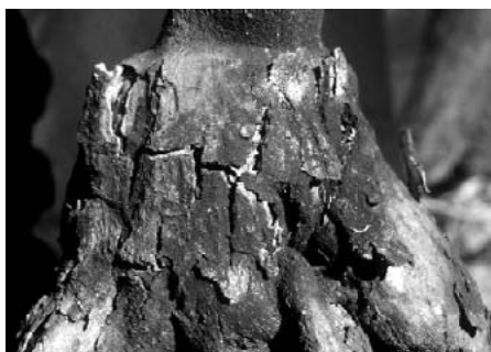
Fig. 1. Bark-scaling on Flying Dragon trifoliolate orange grafted with Comune Clementine infected with CEVd.

Tree growth was compared by analysis of canopy volume data at the end of the trial. Figure 3 shows major growth of trees grafted on Swingle citrumelo, followed by trees grafted on S. Marina sour orange,