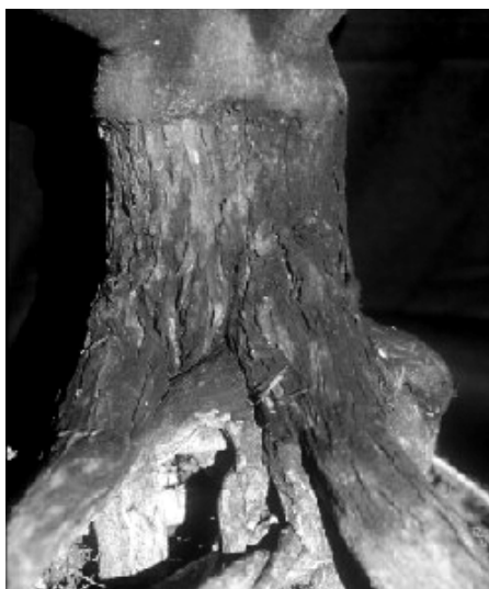
Fig. 2. Bark-scaling on Rubidoux trifoliolate orange grafted with Comune Clementine infected with CEVd.

All trees began to yield fruit in 1994 (Table 1) but a remarkable production was only observed from 1996, 4 yr after planting. In 1996 the highest yield was achieved in trees grafted on Swingle citrumelo but the difference was statistically