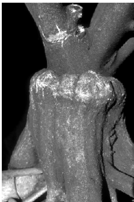
Fig. 5. BA300 citrange grafted with Comune Clementine infected with CEVd.

Trees grafted on Rubidoux C.R.C. 838 trifoliolate orange showed exocortis symptoms, and they were stunted and gave poor yield 15 yr after inoculation. BA-300 citrange did not show any bark-scaling 15 yr after inoculation, demonstrating its tolerance to the exocortis viroid (6). The CEVd isolate used in the trial which is widely spread in many different old-line citrus caused no exocortis symptoms in any of the citrange rootstocks under our envi-