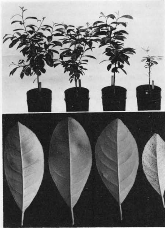
FIGURE 2. Response of Florida rough lemon plants to infection with vein enation and yellow vein viruses. Top, (left to right) noninoculated plant, plant infected with yellow vein virus alone, plant infected with vein enation virus alone, and plant infected with both vein enation and yellow vein viruses, showing synergistic dwarfing and severe symptoms of yellow vein; bottom, corresponding leaves from plants at the top, showing severe yellow vein symptoms in the leaf (extreme right) infected with both yellow vein and vein enation viruses.

duce yellow vein symptoms. These results indicated that P. trifoliata is immune from yellow vein virus.