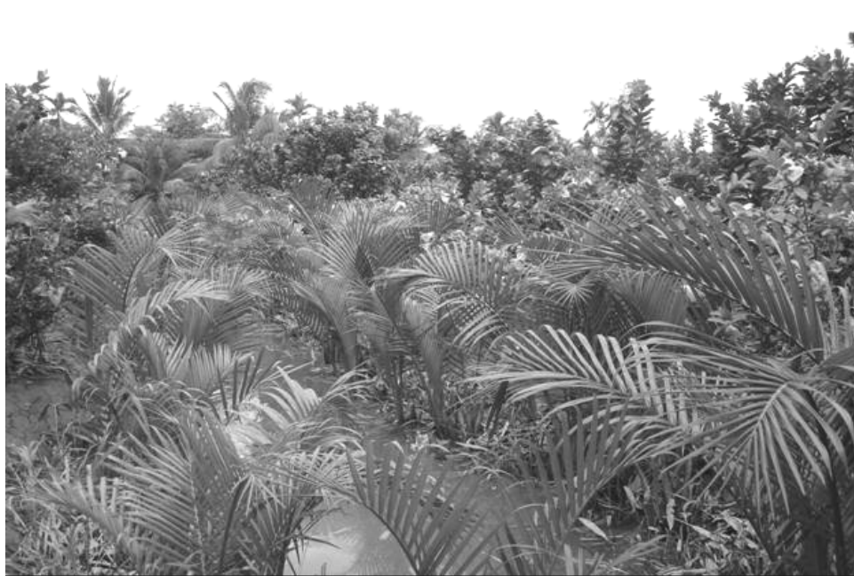
Fig. 2. Intercropping in Mekong Delta region of South Vietnam. Guava and citrus intercropped on raised beds with occasional coconut and banana and bordered by water coconut along ditch banks (as illustrated). The form of intercropping varies, and some instances cajuput ( Melaleuca cajuputi Powell) is planted on the sides of beds to reduce the risk of sunburn damage to fruit.

compared to the majority of commercial citrus planting in the Western world. Presumably, as the density of guava plants decreases within an area, so will the concentration of volatiles produced that inhibit psyllids, potentially jeopardizing effectiveness. The minimum density of guava plants per unit area to be effective is unknown.