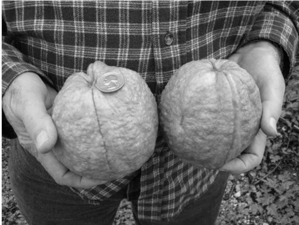
Fig. 4. Examples of commercially grown white guava fruit. Coin on top of left fruit is ca. 2.5 cm in diameter.

Fig. 3. White guava fruit being grown commercially in south Florida. Value of each fruit is quite high thus fruit are individually covered with a styrene netting and clear plastic bags to protect them from scaring and insect damage.