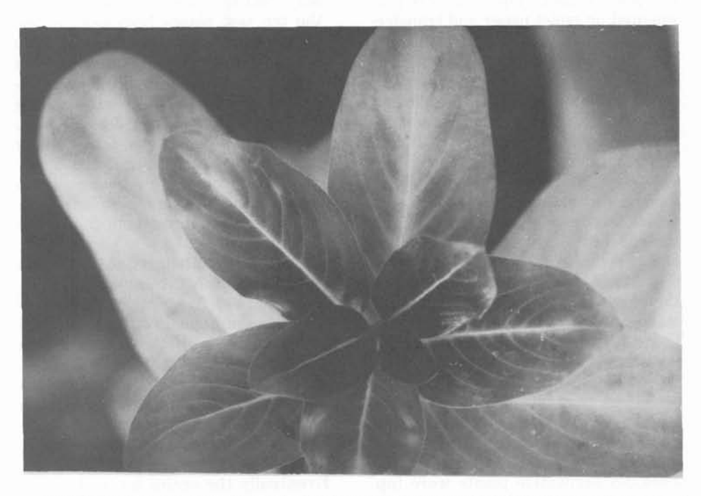
Fig. 2. Huanglungbin affected periwinkle showing early localized yellowing symptoms along the secondary veins.

Electron microscope examination. Thin sections of leaf tissue of D. citri -inoculated Ponkan mandarin