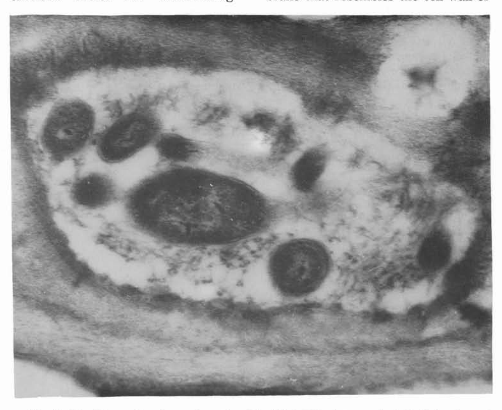
Fig. 5. Ultrathin section from a huanglungbin affected Ponkan mandarin leaf showing one sieve tube cell with the bacteria-like organism. (39,600X).

huanglungbin agent from citrus to periwinkle. Cuscuta campestris may be ideally suited for separating the mixed infections in the field (10). However, we have failed to transmit the agent from periwinkle to citrus using C. campestris. The reason for this failure is unknown. Further experiments to answer this question are in progress. Although C. japonica survived well on both infected citrus and periwinkle, it did not transmit the huanglungbin agent. The failure to do so could be due to different vector specificity. The BLO's introduced into periwinkle plants through C. campestris have characteristics similar to the greening agent in periwinkles described by Garnier and Bove (8). The organism is sieve-tube limited and is enveloped by three zones: a dark and electron-absorbing cytoplasmic membrane; an intermediate, electrontransparent zone; and an outer membrane that resembles the cell wall of