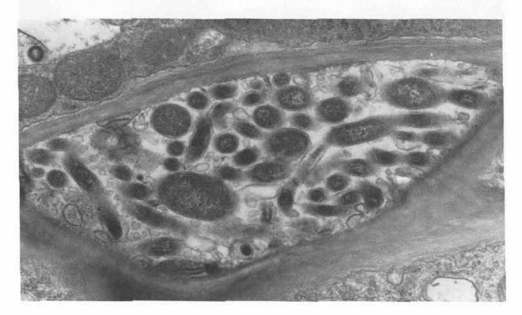
Fig. 4. Ultrathin section from a huanglungbin affected periwinkle leaf showing one sieve tube cell packed with the bacteria-like organisms. (28,600X).

the sieve tubes of these samples but not in those of control plants. BLO's had an envelope comprising three zones: an electron-absorbing inner membrane; a dark outer membrane;