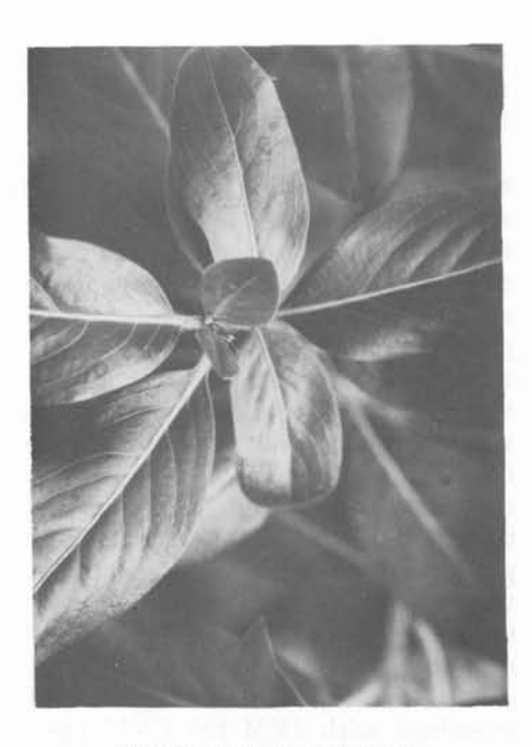
Fig. 1. Healthy periwinkle.

symptoms. New leaves that developed from affected branches were also small and yellowed (figs. 1, 2, 3). The incubation period prior to