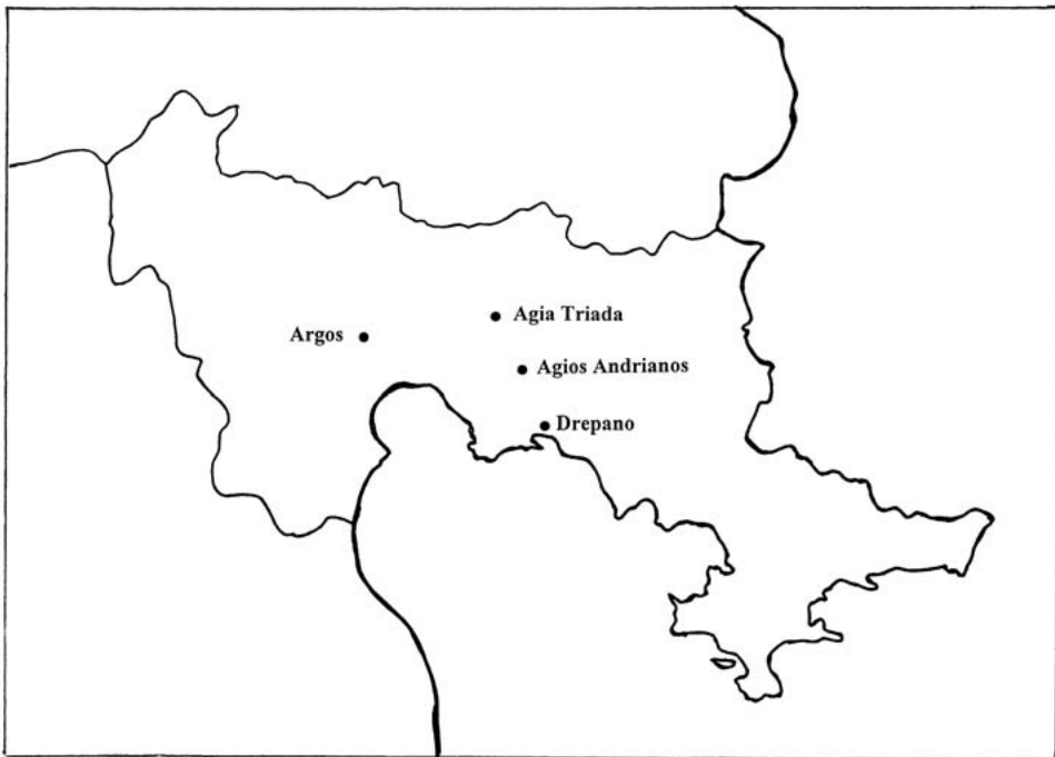
Fig. 2. Locations of apparent natural spread of Citrus tristeza virus in Argolis Prefecture.

The illegal introduction of CTV-infected citrus prompted the adoption of the following strategy: 1) inspection services in all citrus area were alerted; 2) a call was made on local broadcast stations all over Greece inviting growers and users to report any Lane Late trees obtained privately, as well as any citrus material brought from abroad,