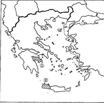
Fig. 1. Map of Greece showing location of two prefectures where Citrus tristeza virus was introduced; 1 = Argolis, 2 = Hania.

were distributed over the whole plain of Argos, while two were taken to Lakonia. Six more trees in Argolis were found positive, bringing the total number in that area to seven. The two trees in Hania were found