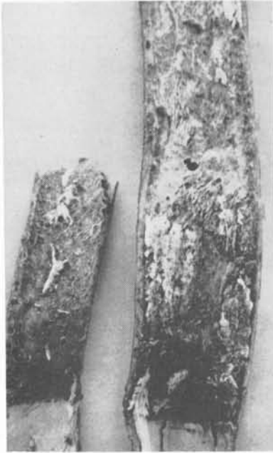
FIGURE 1. Bark of diseased Clementine mandarin trees, group 5. Note impregnation concentrated above bud-union and honeycombing in scion.

Ten replicate trees of each group (20 in group B) were chosen for further study. The 20 trees in group B were divided according to topographical proximity into two sets of ten each. These two sets were considered as separate treatments in the statistical analyses, although no significant differences were found between them.