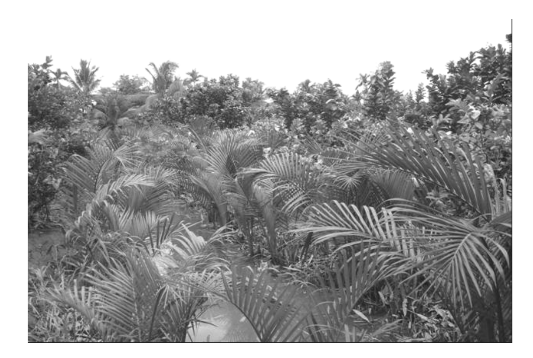
Fig. 2. Intercropping in Mekong Delta region of South Vietnam. Guava and citrus intercropped on raised beds with occasional coconut and banana and bordered by water coconut along ditch banks (as illustrated). The form of intercropping varies, and some instances cajuput ( Melaleuca cajuputi Powell) is planted on the sides of beds to reduce the risk of sunburn damage to fruit.

compared to the majority of commercial citrus planting in the Western world. Presumably, as the density of guava plants decreases within an area, so will the concentration of volatiles produced that inhibit psyllids, potentially jeopardizing effectiveness. The minimum density of guava plants per unit area to be effective is unknown.