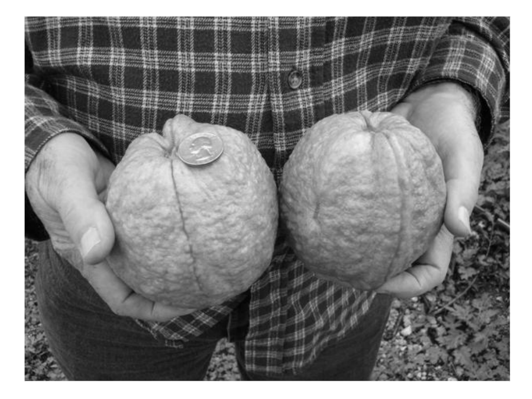
Fig. 4. Examples of commercially grown white guava fruit. Coin on top of left fruit is ca. 2.5 cm in diameter.

Fig. 3. White guava fruit being grown commercially in south Florida. Value of each fruit is quite high thus fruit are individually covered with a styrene netting and clear plastic bags to protect them from scaring and insect damage.