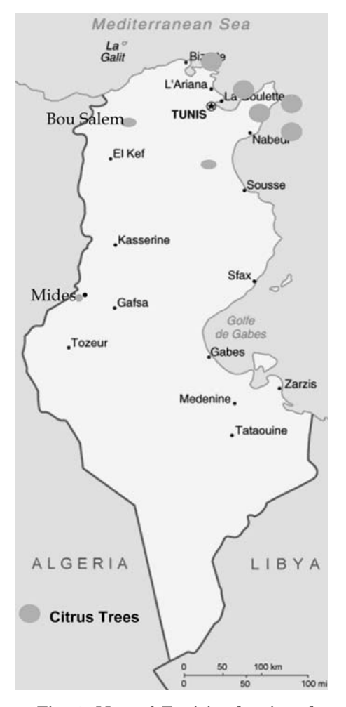
Fig. 1. Map of Tunisia showing the citrus growing areas.

Etrog citron plants graft-inoculated with tissue from these cultivars developed symptoms characteristic of viroid infection. Further, sPAGE analysis (4) and molecular hybridisation using viroid specific probes (3) revealed that all cultivars were infected with at least two viroids. Citrus exocortis viroid (CEVd), Citrus bent leaf viroid (CBLVd), Hop stunt viroid (HSVd), Citrus viroid III (CVd-III) and Citrus viroid IV (CVd-IV) were found to be widespread, occurring in respectively 68.4%, 32.7% 67.8% 81.0% and 2.3% of the 174 sources tested.