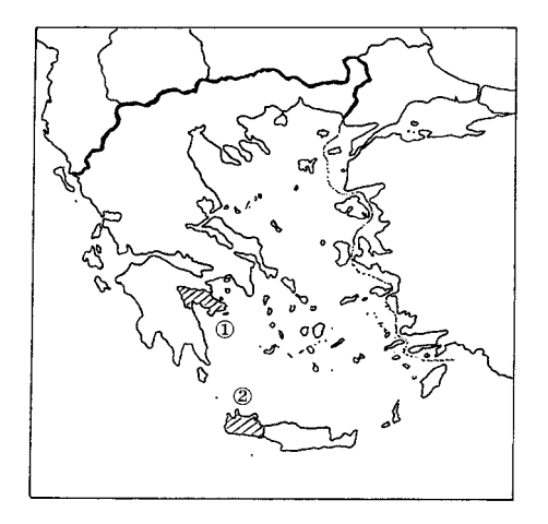
Fig. 1. Map of Greece showing location of two prefectures where Citrus tristeza virus was introduced; 1 = Argolis, 2 = Hania.

were distributed over the whole plain of Argos, while two were taken to Lakonia. Six more trees in Argolis were found positive, bringing the total number in that area to seven. The two trees in Hania were found