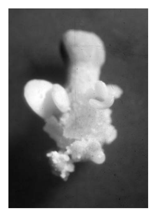
Fig. 1. Citrus embryos from style and stigma cultures.

Following the protocol of D'Onghia et al. (4), flowers were collected before opening and were surface-sterilized by immersion for 5 min in ethanol (70% v/v in water), 15 min in 2% sodium hypochlorite (w/v in water). Stigmas and styles were excised aseptically from flowers, and placed vertically onto Murashige and Skoog (6) semi-solid (7 g/l agar) medium (MS) containing sucrose (146 µM), malt extract (0.5 g/l) and BAP (13 µM). The pH of the medium was adjusted to 5.7 ± 0.1 with 0.5 M KOH before autoclaving at 121°C for 15 min. Explants and calluses were subcultured onto fresh medium at 30-day intervals and maintained in a climate chamber at 25 \pm 1 °C under a 16 h day length, and a photosynthetic photon flux of 100 umol m<sup>-2</sup>s<sup>-1</sup> Osram cool-white 18 W fluorescent lamps. Somatic embryos (2-3 mm in diameter) were isolated from embryogenic cultures (Fig. 1) and germination was attempted in hormone-free MS medium.