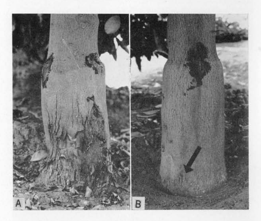
FIGURE 2. Comparative reactions of Morton citrange stocks (under calamondin) to different strains of exocortis virus. A. Severe exocortis on tree inoculated with severe strain. B. Mild exocortis (arrow) just below original soil line on tree inoculated from mild strain. Photographed 5 years after inoculation, in Plot 4.

STRAINS OF EXOCORTIS VIRUS.—Indicator trees inoculated with buds from some exocortis sources gummed and developed bark cracking and shelling more quickly and severely than trees inoculated with buds from other sources. Since the time required for symptoms to develop, as well as the severity of these symptoms, was consistent for each exocortis source, it is concluded that different sources carry different strains of exocortis virus. A strain carried by the old-line CES Eureka lemon is