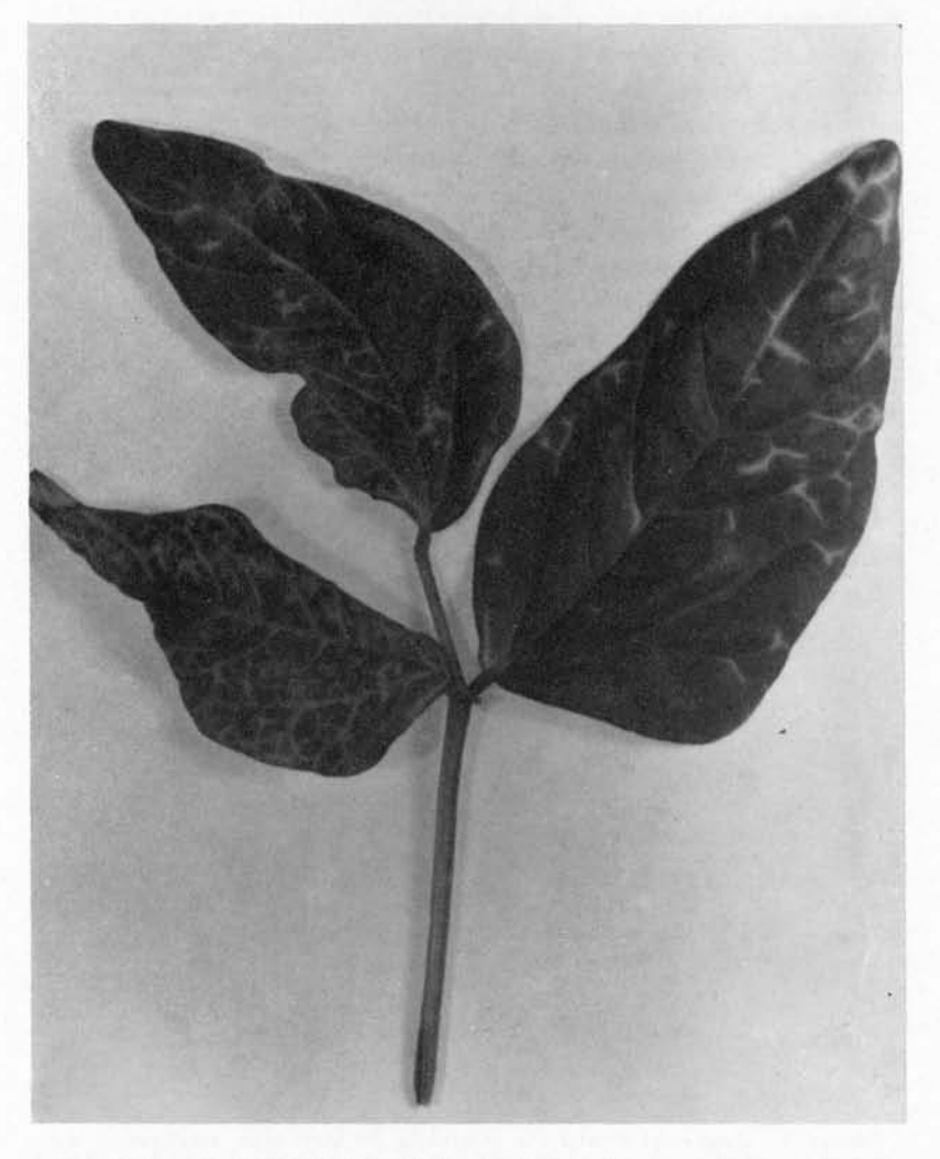
FIGURE 2. Leaves of Vigna sinensis 'Ramshorn Blackeye' 30 days after mechanical inoculation with infectious variegation virus from Eureka lemon.

Inoculated plants of Vigna sinensis 'Lady Finger', 'Lady Finger Round', and 'Ramshorn Blackeye' developed no immediate symptoms on the primary (inoculated) leaves. In 10-30 days, however, the trifoliate leaves developed chlorotic vein clearing, leaf twisting, and curling (Fig. 2). The inoculated leaves turned yellow and abscised. The