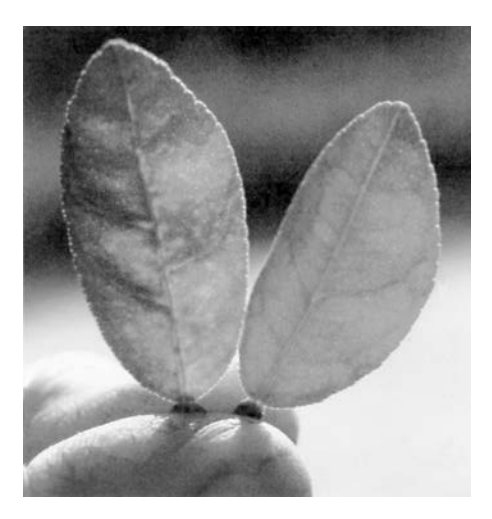
Fig. 2. Symptoms in Mexican lime leaf induced by the citrus tatter leaf virus inoculated into Mexican lime from tatter leaf infected 'Meyer" lemon. Control leaf on right.

cut back to produce a second flush of new growth. Inoculated plants were observed for symptoms for 4 to 6 mo after inoculation. Eleven additional experiments, a continuation of the experiment of Roistacher (6), were conducted from January, 1987 through April, 1998, extending the period of testing of the holding plants from 12 to over 22 yr.