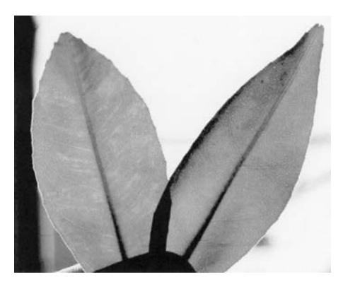
Fig. 3. Mild mottle in the leaf of Dweet tangor inoculated with symptomatic tissue of Mexican lime (Fig. 1). Control leaf on right.

Sequential from passage Meyer lemon TL-102 to Mexican lime and through rough lemon. As shown in Fig. 1, the tatter leaf component from Meyer TL-102 transmitted to ML and then to rough lemon as the holding plant was not expressed in the CE indicators until 3.3 to 6 yr. This indicated some form of slow incubation or replication in the rough lemon holding plants. This delayed reaction in the rough lemon holding plants also occurred with two other Meyer lemon source trees: Meyer TL-100 and Meyer TL-101 (6) where delay before symptom expression in CE was 4 and 5 yr respectively. Thus, both the tatter leaf and citrange