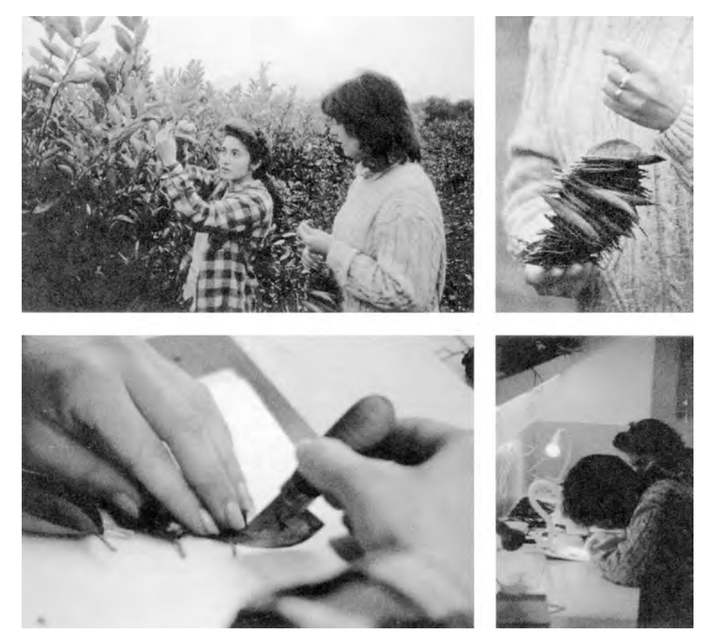
Fig. 1. A two person-team collecting samples in open field. Leaves from a plant are held on a wire and each set is separated from another by a piece of plastic. Petioles are cut and membranes imprinted with them in the laboratory of Viveros Valencia (Peñíscola, Spain) citrus nursery.

terial remains succulent over the growth of the plants in the nursery, and can be easily collected without damaging the plants. In addition, prints from leaf petioles occupy less space on a membrane than sections of the stems, allowing a higher number of tests per membrane. Table 1 summarizes the evaluation of the routine analysis of nursery plants performed by a two-worker team by different techniques.