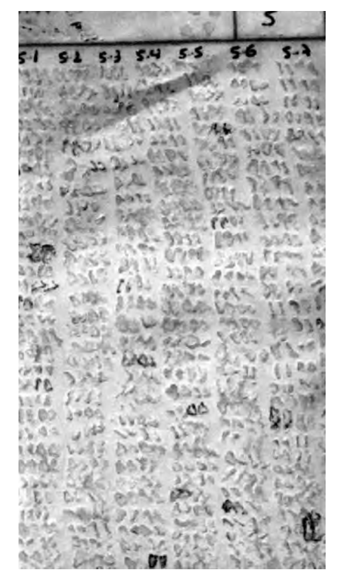
Fig. 4. Overview of a 7 \times 13 cm membrane printed with stem sections. The stained vascular area of stem sections indicate that the plants are infected with CTV.

were CTV negative by both techniques. The four trees CTV positive only by PCR were sampled again and analyzed by nested-PCR in a single closed tube and indexed on Mexican lime indicator plant, and all were found negative by both methods.