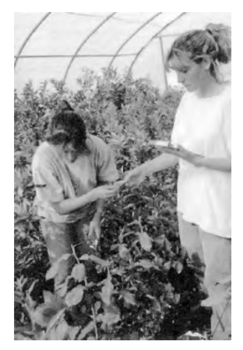
Fig. 2. The first worker collects leaf samples, cuts the petiole and passes each leaf to a second worker who imprints the membrane. The operation is performed under an insect-proof plastic tunnel at Viveros Alcanar (Alcanar, Spain citrus nursery).

sue print-ELISA were confirmed as infected by both techniques. Of the seven trees which were positive by PCR only four were positive by IC-PCR and negative by tissue print-ELISA, and the remaining three