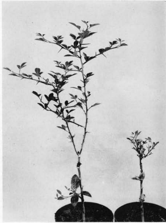
FIGURE 3. Effects of yellow vein and vein enation viruses on Poncirus trifoliata on West Indian lime rootstock. Left, plant with yellow vein alone; right, plant with both yellow vein and vein enation.

Yellow vein symptoms developed in all the new growth of P. trifoliata scions grafted on doubly-infected lime stock. Transfers of buds from these affected P. trifoliata tops to healthy West Indian lime plants induced yellow vein symptoms. Many of these P. trifoliata tops were killed. A plant of P. trifoliata on lime rootstock exhibiting the severe synergistic dwarfing and vein yellowing symptoms is shown in Fig. 3. None of the control plants (healthy P. trifoliata grafted to lime with