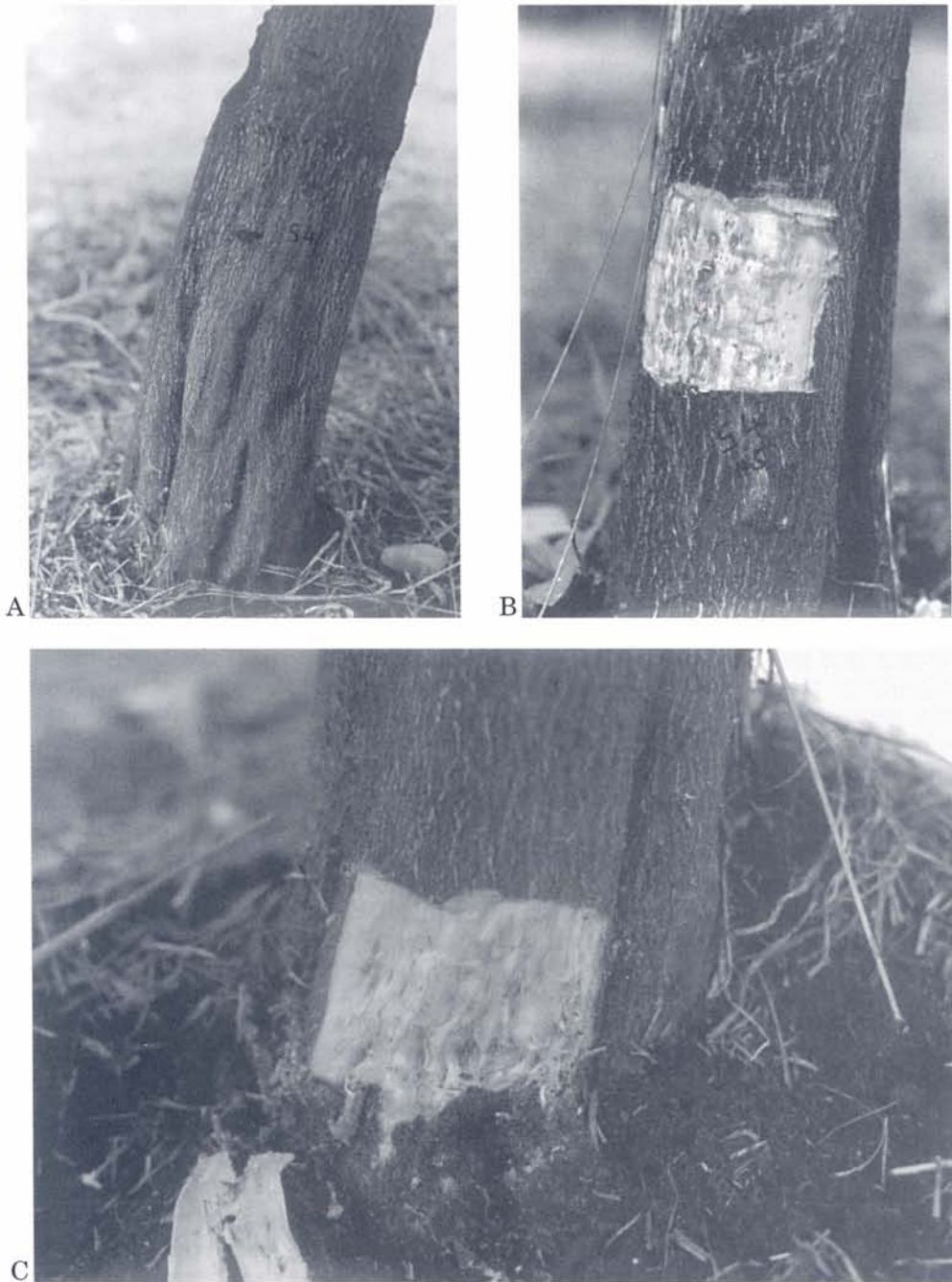
Fig. 2. Symptoms on P. trifoliata rootstock associated with the gum pocket agent. 2A) Fissuring of the rootstock. 2B) Gum pockets and pitting in wood on the flattened western side of the rootstock. 2C) Deep pits on flattened side of stock near ground level.