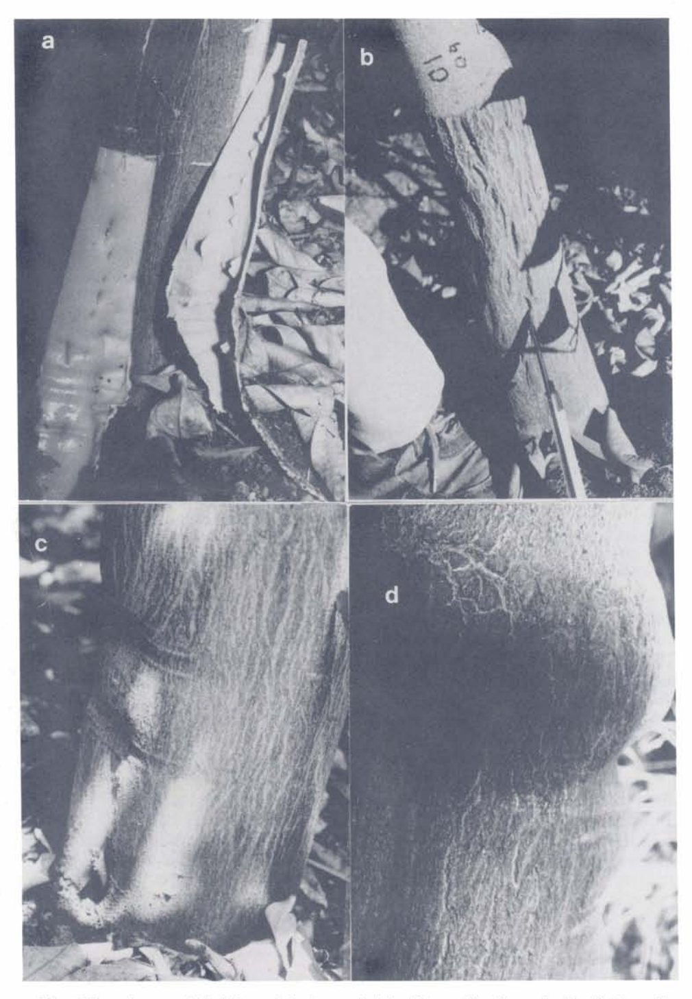
Fig. 2. Symptoms on trifoliate rootstock associated with specific citrus viroids. A) Deep pits in the wood and pegs in bark associated with CVd-Ia. B) Mild cracking in the bark associated with CVd-IIa. C) Finger imprint with striations in the bark associated with CVd-IIIb. D) Finger imprint and mild bark cracks associated with a mixture of CVds-Ib, CVd-IIa and CVd-IIIb.