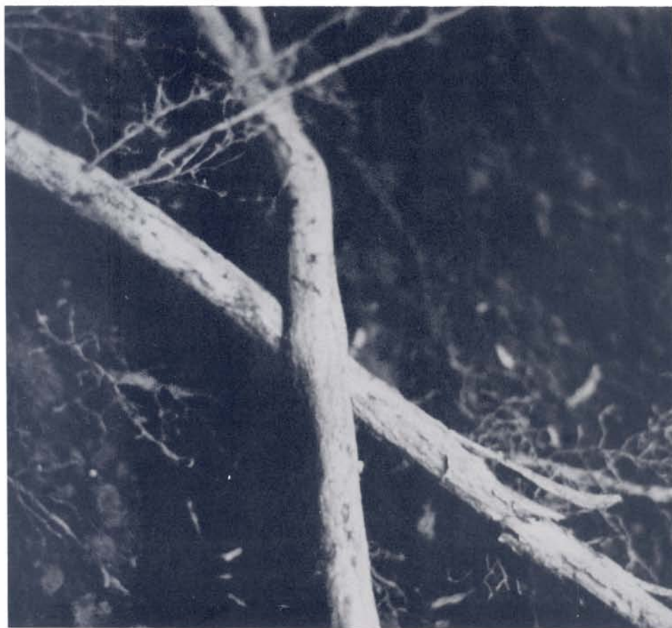
Fig. 2. Overlapping roots from adjacent trees which have grafted, allowing possible transmission of CEV.

As the infected budlines were free of CEV when planted in the budwood multiplication block, sources of contamination were sought. Prior Lisbon trees 86 and 87 were planted immediately adjacent (1.6 and 3.2 m respectively) to a CEV-infected Monroe Lisbon lemon clone, whereas the Villafranca lemon trees were in an adjacent row 6.6 m away (fig. 1). The proximity of these infected trees to the Monroe Lisbon, and the fact that no