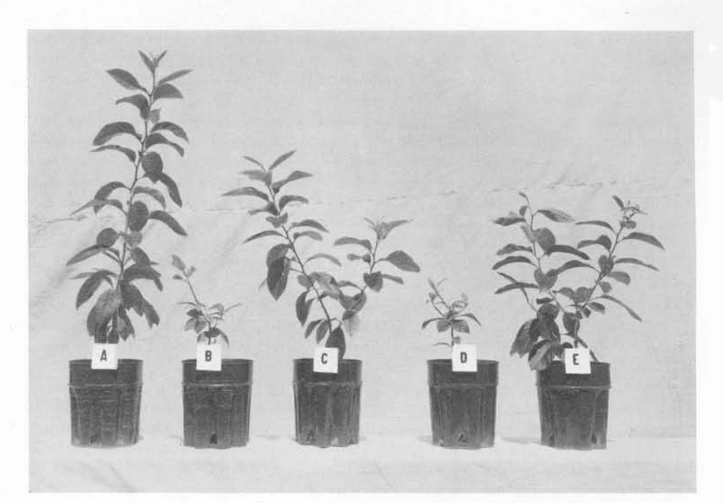
Fig. 3. Reaction of lemon seedlings to the two virus strains obtained from shoot B of infected, heat-treated lime seedling: A) self-grafted, noninoculated lemon seedling; B) and C) lemon plants inoculated, respectively, from plants Å and B (shown in fig. 1); D) and E) lemon plants inoculated from the same respective sources two months later.