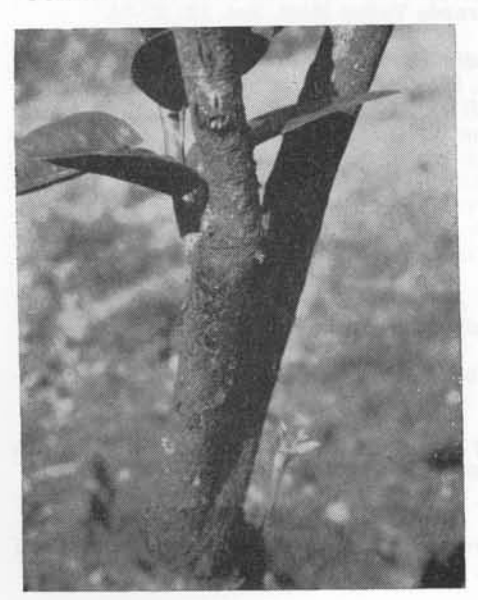
Fig. 2. Bergamot branches showing symptoms of gummosis.

The two major areas of culture are the "Tyrrennian" and the "Jonian" zones which each have