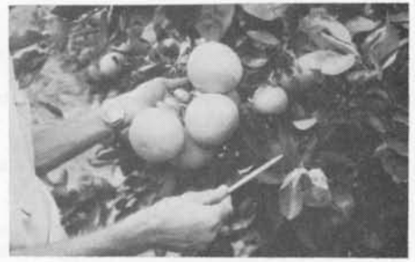
Fig. 2. Normal sized grapefruit being held next to the small fruit on a tristezaaffected grapefruit tree at Nkwalini.