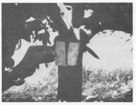
Fig. 1. Severe stem pitting on a young Redblush grapefruit tree at Nkwalini.

The symptoms of tristeza on these young trees include stunting, severe stem pitting (fig. 1), small fruit (figs. 2 and 3) and several small leaves with deficiency symptoms. A survey of the affected orchard showed that virtually all the 500 trees had developed these symptoms, while only 2.5% of the sister trees (i.e. propagated from the same parent tree) planted at