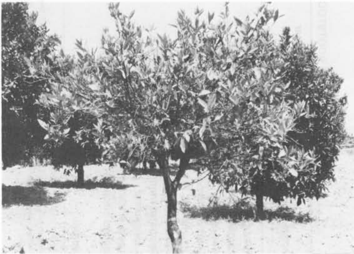
Fig. 2. Severe decline in the 9th growing year of a Clementine grafted on alemow.