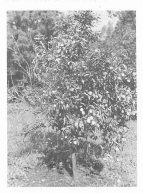
Fig. 2. Six-year-old Valencia orange tree partially affected by marchitamiento repentino disease.

All trees with "marchitamiento repentino" were budded on a local selection of trifoliate orange. Experimental work underway will certainly show if the disease is related to this rootstock or will affect trees on other rootstocks.