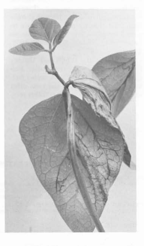
Fig. 4. Necrosis on cowpea inoculated with Okitsu-Wase isolate.

Dip preparations were obtained from infected cowpea leaves and stems, and from infected citrus leaves (table 5). Flex-