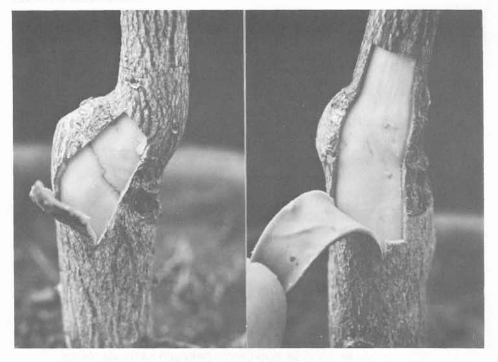
Fig. 1. Bud-union crease of Satsuma on P. trifoliata one year after inoculation (left); normal union (right).