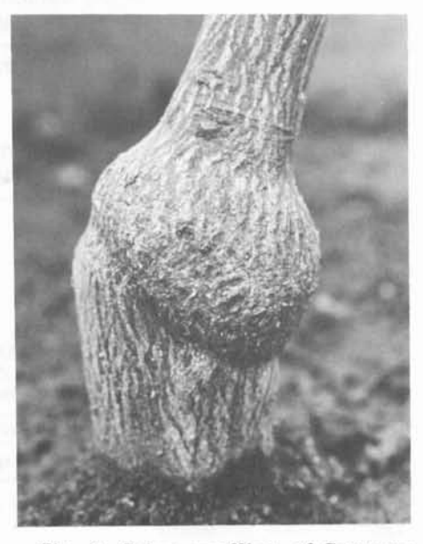
Fig. 2. Scion swelling of Satsuma on P. trifoliata root, six years after inoculation.

Young leaves collected from budunion-creased Satsuma budlings were used for mechanical inoculations to cow-