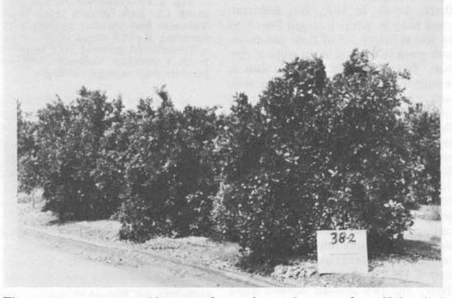
Fig. 2. Three 10-year-old trees of experiment 2 grown from Valencia buds carrying R4SY4 virus when propagated on healthy sour orange seedlings. The two control trees adjacent to this group died early from natural infection.

The early, severe reaction of six of the eight control trees in this group and the performance of the immunized trees make it obvious that the presence of the RSY4 virus in these trees has provided good protection against naturally occurring strains of tristeza virus although the RSY4 virus itself has reduced the growth rate of most of the trees. Three preimmunized Valencia on sour orange trees of this experiment are shown in fig. 2.