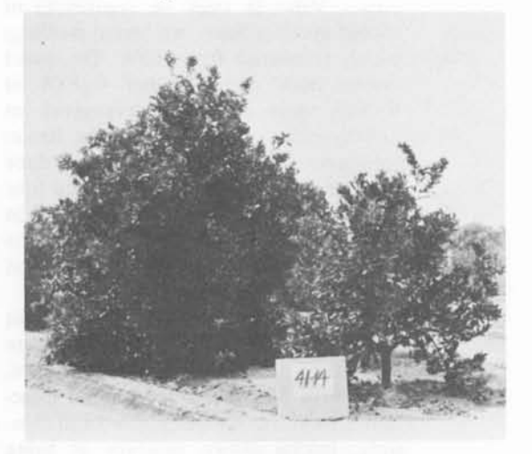
Fig. 1. Ten-year-old trees in experiment 1A. Left, grown from healthy Valencia bud on sour orange cutting carrying R<sub>1</sub>SY2 virus. Right, a naturally-infected control tree developed from a healthy Valencia bud on a healthy sour orange cutting.

feet high, definitely stunted from tristeza infection, but now in somewhat of an equilibrium stage of the disease. One of these and a preimmunized tree of group 1 are shown in fig. 1.