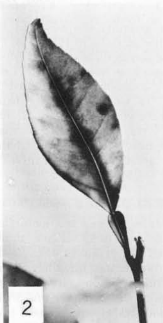
Fig. 2. Chlorotic leaf of sweet orange with green patches on narrow lamina.

ing. Some seeds in diseased fruits develop normally, but most are small and dark colored.