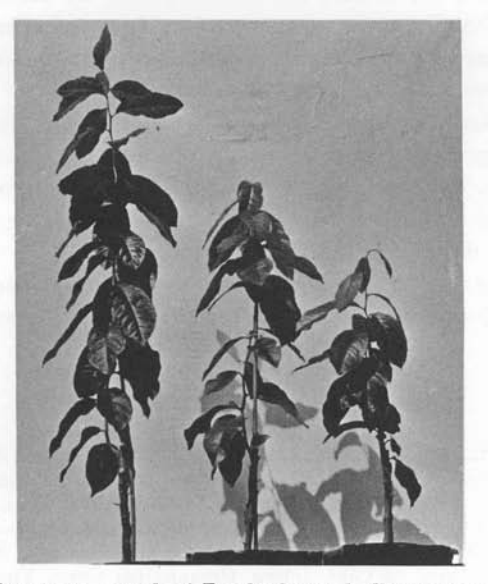
FIGURE 2. Reduction in growth of Eureka lemon budlings on sour orange inoculated with stubborn. Left: Non-inoculated check.

To ascertain the identity of the disease, transmission tests were made in the field and in the greenhouse. Inoculation tissues, bark or buds, were taken from a Tarocco orange tree showing typical symptoms. The inoculum source was indexed for psorosis, exocortis, and xyloporosis. After 8 months, the psorosis tests were positive, the exocortis tests on Rangpur lime ( C. limonia Osbeck) were negative, and indexing for