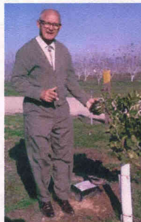
He will be missed!