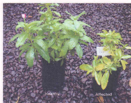
Figure 1. HLB affected periwinkle showing generalized yellowing symptoms (Affected) beside a non-affected plant (Healthy).