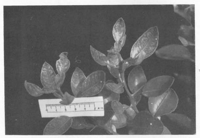
FIGURE 2. Fully developed leaves of Marsh grapefruit on rough lemon after inoculation with the disorder found in Malvasio tangerine.

Group 8.—Buds taken from a Marsh grapefruit seedling and pieces of bark from a diseased Malvasio tangerine seedling were used. The grapefruit buds grew into trees that were stunted, with small leaves that had deficiency symptoms. Lines of gum discoloration coinciding with the line of the inoculating bark appeared in the wood underneath the bark.